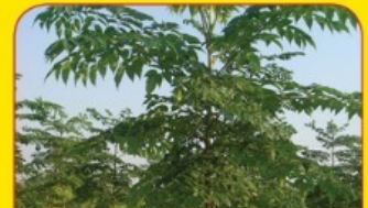
Malabar Neem Tree